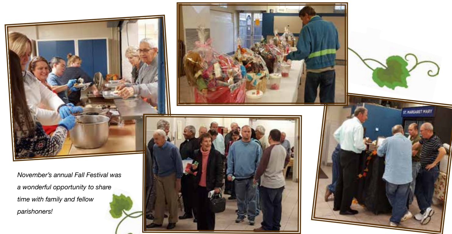
November's annual Fall Festival was a wonderful opportunity to share time with family and fellow parishioners!